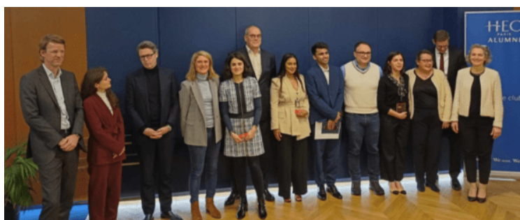
7 HEC Students Honored for Their Excellence