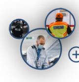
OTHERS (SECURITY, CLEANING, ETC)

In 2023, the percentage of companies struggling to fill open job positions reached its highest peak in the last 17 years (77%) and the cost to recruit each deskless worker reached 5 thousands euros.