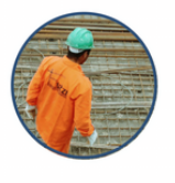
LOGISTICS & TRANSPORT